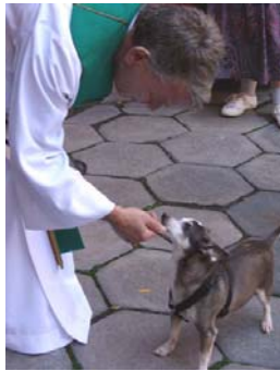
Blessing of the Animals, October 2006

We welcome all to worship with us and become part of our extended Christian family. Services are at 11:45 a.m. each Sunday (except during August) at St. Peter's Church, 346 West 20 th Street, New York, NY 10011.